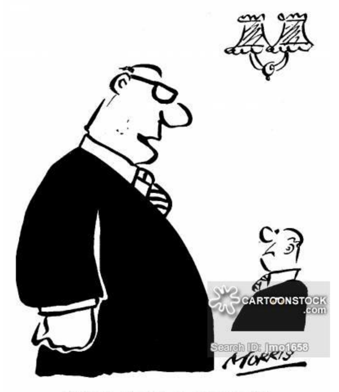
"What about a merger?"