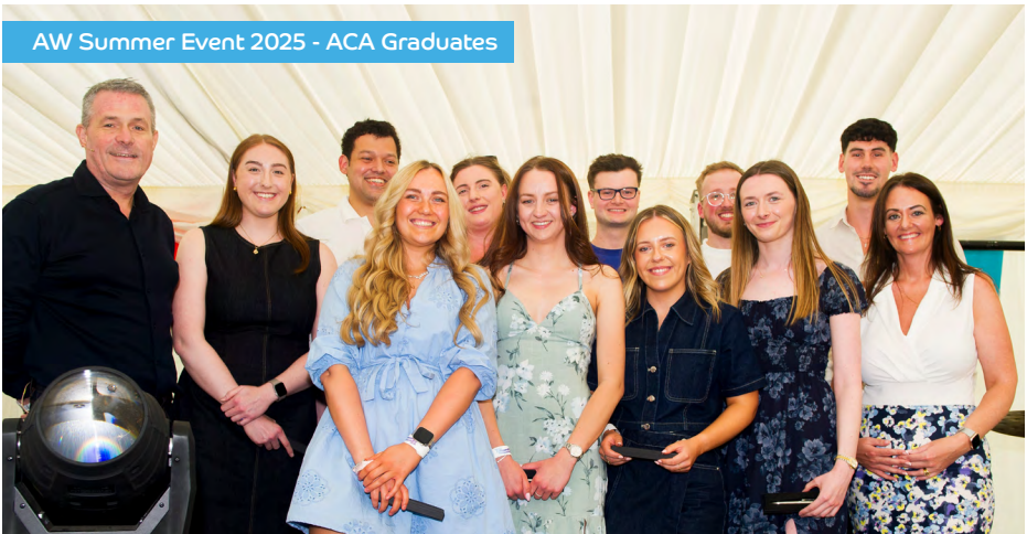
AW Summer Event 2025 - ACA Graduates